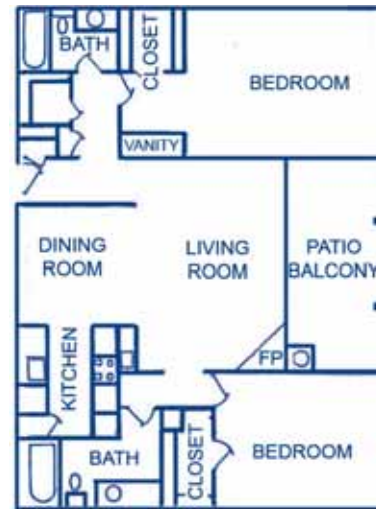
F 2 Bedrooms/ 2 Baths 1,288 Square Feet