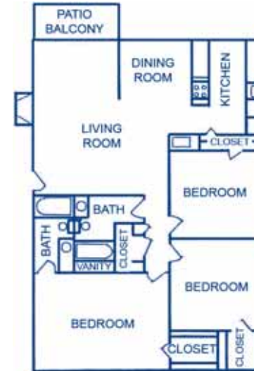
H 3 Bedrooms/ 2 Baths 1,387 Square Feet

Providing Comfort, Convenience and Customer Service