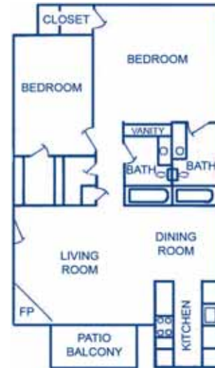
E 2 Bedrooms/ 2 Baths 1,020 Square Feet