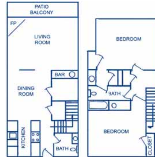
G 2 Bedrooms/ 2 Baths 1,361 Square Feet