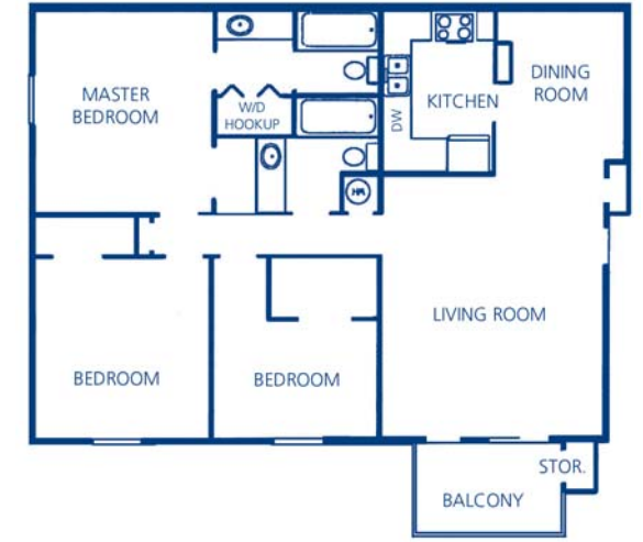
C 3 Bedrooms/ 2 Baths 1,550 Square Feet