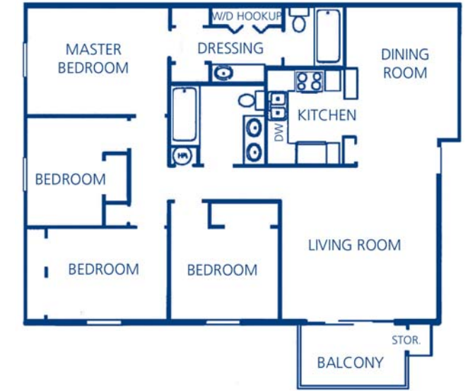
D 4 Bedrooms/ 2 Baths 1,600 Square Feet