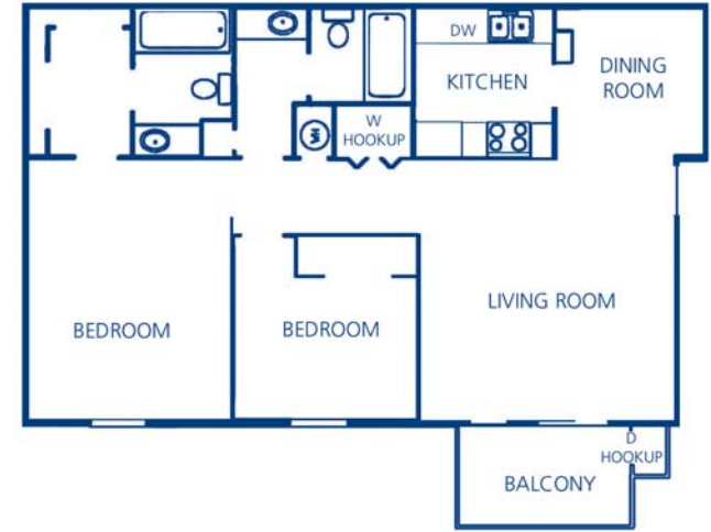
A 2 Bedrooms/ 2 Baths 1,000 Square Feet