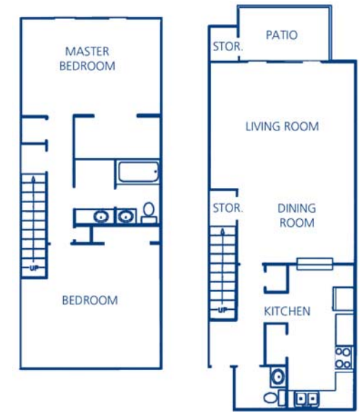
B 2 Bedrooms/ 1.5 Baths 1,440 Square Feet